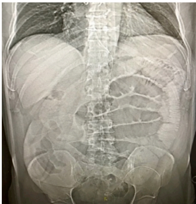
Figure 2. X ray showing dilated loops of bowel.

The patient underwent laparoscopic total proctocolectomy with trans-anal total mesorectal excision and end ileostomy. The patient tolerated liquid diet postoperatively. However, on postoperative day three, developed nausea, vomiting and increased abdominal distention with absent ileostomy output. Abdominal X ray (Figure 2) showed diffuse distention consistent with postoperative ileus. Decompression with nasogastric tube yielded 1.5 liter output.