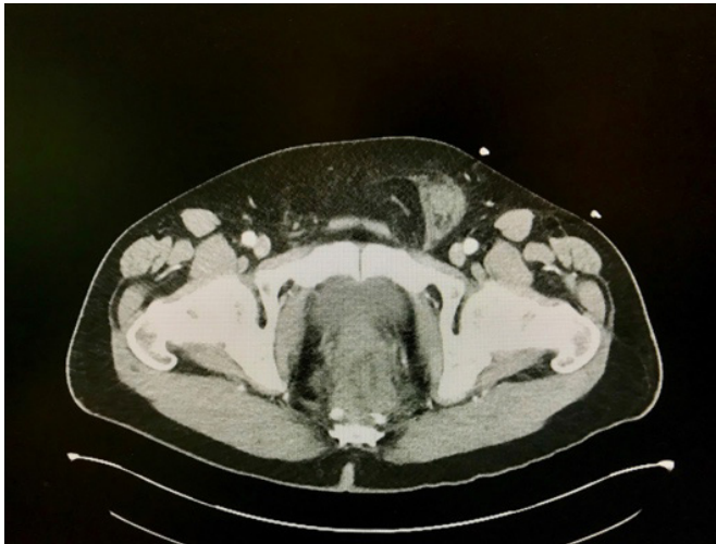
Figure 3. CT scan revealing incarcerated left inguinal hernia with tissue stranding.

On postoperative day seven, the patient reported new onset of severe pain in the left groin. Physical exam confirmed an irreducible, tender bulge suspicious for an incarcerated inguinal hernia. CT scan of the abdomen and pelvis (Figure 3) confirmed fat containing inguinal hernia with standing and inflammatory changes.