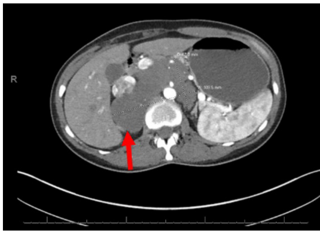
Figure 1. CT Axial Image of Retroperitoneal Mass. Published with Permission

Following the diagnosis of the mass, a multidisciplinary discussion between general surgery and neurosurgery was conducted to assess its resectability. Given the extent of SMA and celiac artery encasement, the tumor would need to be debulked, and vascular reconstruction may be necessary. Risks, benefits, and alternatives were discussed, and the patient opted to proceed with surgical resection of the mass. In preparation for the surgery, her adalimumab was held.