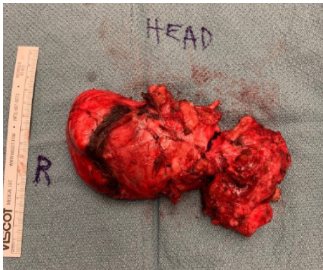
Figure 3. Retroperitoneal Mass After Removal. Published with Permission

Postoperatively, the patient did well without any complications. Her diet was advanced on postoperative day 2, during which she also had a return of bowel function. On postoperative day 4, her drain was removed with significant passage of ascites. A CT angiogram showed few residual ascites and patent vasculature (SMA and right renal artery). She was then discharged.