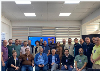
(Click to Enlarge)