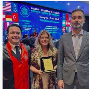
(Click to Enlarge)