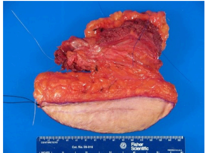
Figure 1. Pathologic specimen consisting of metastatic colon adenocarcinoma embedded within the abdominal wall.

Surgery was performed using an open approach, during which an abdominal mass was found in the right rectus abdominis extending laterally into the external and internal oblique muscles. Flaps were raised superiorly to the umbilicus, medially to the midline, inferiorly to the inguinal ligament and laterally to the anterior superior iliac spine. Posteriorly, most of the dissection was in the pre-peritoneal space except for a small area directly posterior to the tumor that required resection of a small section of peritoneum and omentum. The specimen taken was approximately 10 cm in length (Figure 1). Following excision, the defect created was repaired with mesh. The mesh was placed in an inlay fashion and was tacked to the ASIS and pubic tubercle using orthopedic screws.