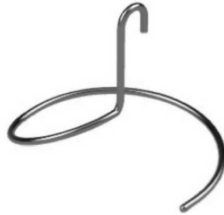
Figure: Components of KeySuite system - KeyScope connected to a laptop (left) and the KeyLoop retractor (right).