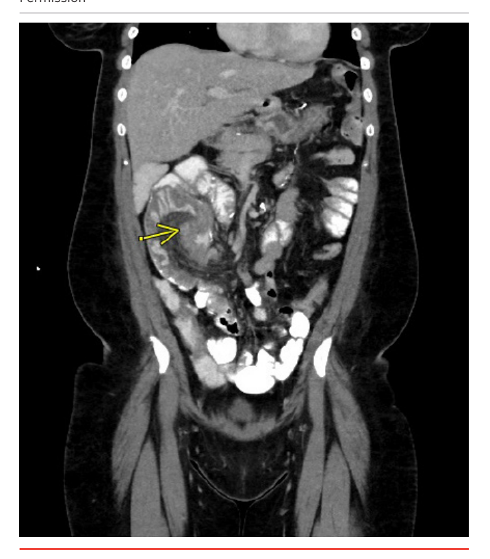
Figure 1. CT Scan Demonstrating Intussusception. Published with Permission

Nine years post-RYGB, the patient presented to the ED once again with complaints of intermittent abdominal pain for one week. Notably, she did not report experiencing nausea, obstipation, or abdominal distention. Upon presentation, her BMI was 32.5, and her vital signs were stable. During the abdominal examination, periumbilical tenderness was noted. Laboratory tests revealed a white blood cell count (WBC) of 7300/mcl; electrolyte levels were within the normal range. A CT scan (Figures 2 and 3) showed a small bowel intussusception involving