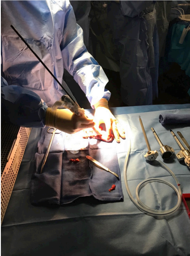
Figure 3. Gamma probe being used to determine ex-vivo radioactive counts of removed parathyroid tissue

For localization of ectopic tissue to be considered successful, the ex-vivo count of excised tissue should be 20 percent or more of the initial background count. In our case, the background count was 147, and the ectopic tissue had a count of 62 (greater than 20 percent of our background), indicating successful localization and removal of tissue. Intraoperative parathyroid hormone levels were then sent at 5, 10, and 15 minutes postexcision and found to be 22, 15, and 13 pg/mL, respectively, indicating surgical cure. Hemostasis was confirmed and a 24 French rigid chest tube was placed. The patient stayed overnight and was discharged home the following day. The patient followed up in clinic one month postoperatively. Labs showed calcium 9.6 mg/dL and PTH of 23.4 pg/mL, and he reported resolution of symptoms.