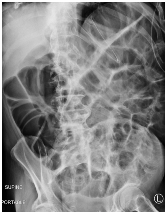
Figure 2. Abdominal X ray of Patient 2 revealing colonic and small bowel dilatation

The patient continued to have persistent colon distension and received a bolus of neostigmine. Two days later, an abdominal X ray showed mild decrease in colonic dilatation. Later that day, a second dose of neostigmine was given with no improvement.