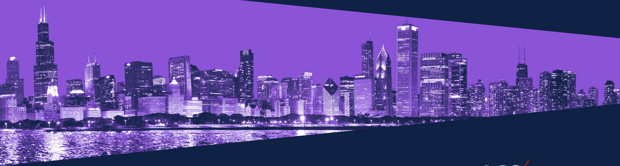
Exhibit Dates: October 5-7, 2025