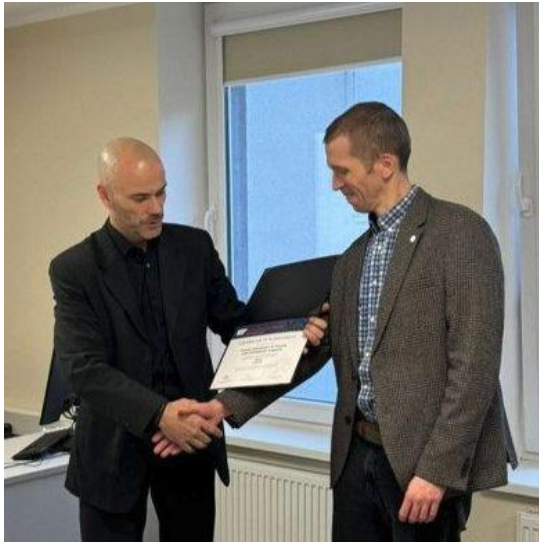
(Click to Enlarge)