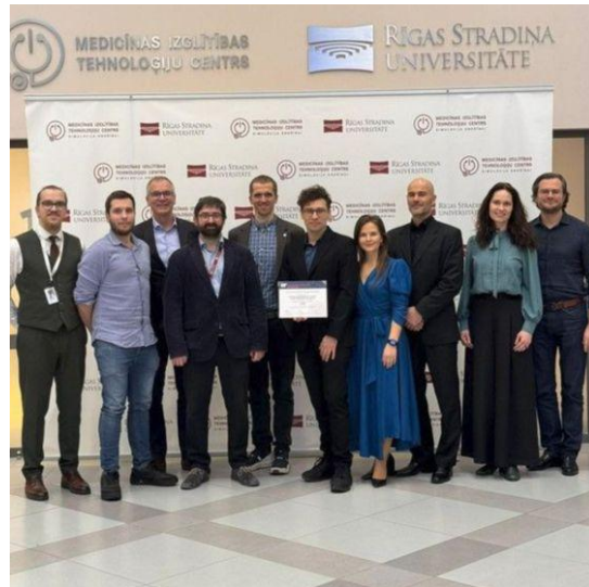
(Click to Enlarge)

If you would like your ATLS success story shared in a future Trauma Education Newsletter, reach out to traumaeducation@facs.org .