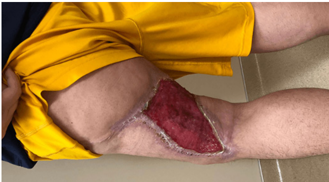
Figure 3. Leg wound at 8-months post-operation