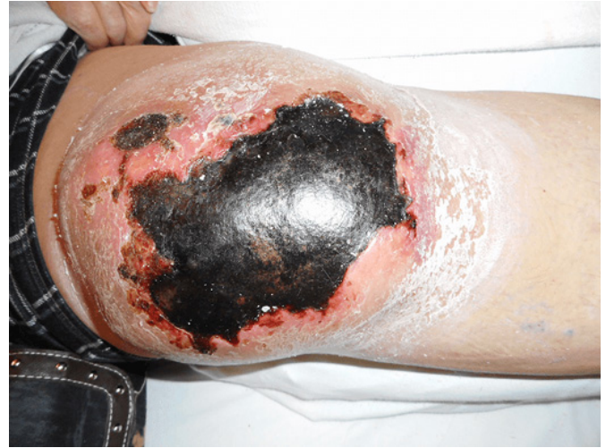
Figure 4. Right knee hematoma at presentation