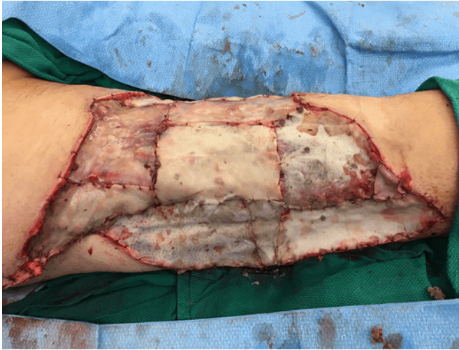
Figure 2. Post-operative leg wound following debridement and coverage with GammaGraft