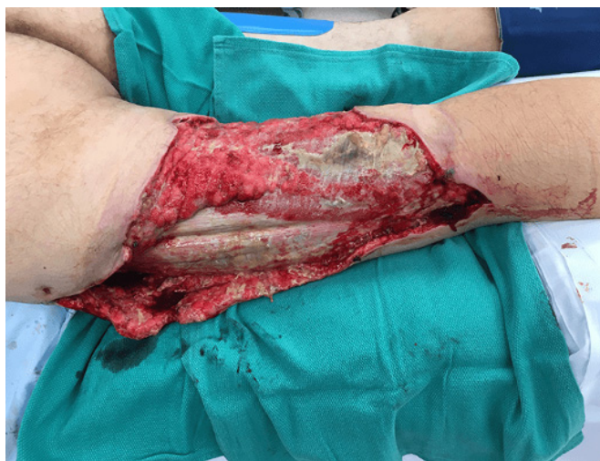
Figure 1. Pre-operative leg wound prior to debridement