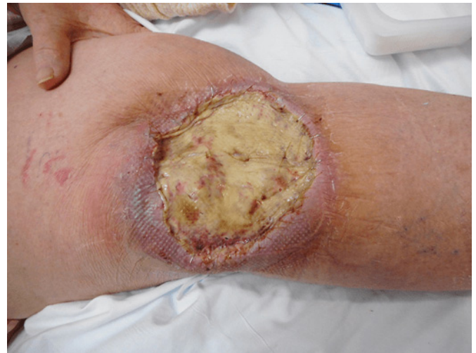
Figure 5. GammaGraft coverage of knee wound