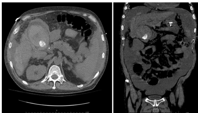
Figure 1. CT of abdomen and pelvis demonstrating gallbladder distension, cholelithiasis, and intraluminal hemorrhage; blood present surrounding gallbladder, liver, stomach, and right paracolic gutter

A 52-year-old male with CTP class C cirrhosis and MELD score of 40 secondary to hepatitis C virus and alcohol abuse was admitted to the hospital for hepatic encephalopathy. Additional complications of his liver disease included hydrothorax, refractory ascites, portal hypertension, and severe coagulopathy. He was admitted to the intensive care unit for management of fluid overload, pulmonary hypertension, and urgent evaluation for potential liver transplantation. Eight days following admission, the patient experienced rapid-onset abdominal pain, and the hemoglobin level abruptly decreased from 9.1 g/dL to 5.1 g/dL. A CT scan of the abdomen revealed distension of the gallbladder with intraluminal blood, as well as hemorrhage surrounding the gallbladder, sub-hepatic space, stomach, and right paracolic gutter (figure 1). Profound hemodynamic instability ensued, leading to the decision