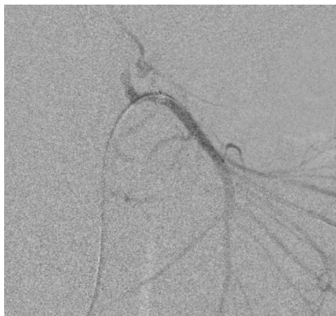
Image demonstrates bleeding off of gastroduodenal artery and in superior pancreaticoduodenal artery cascade.