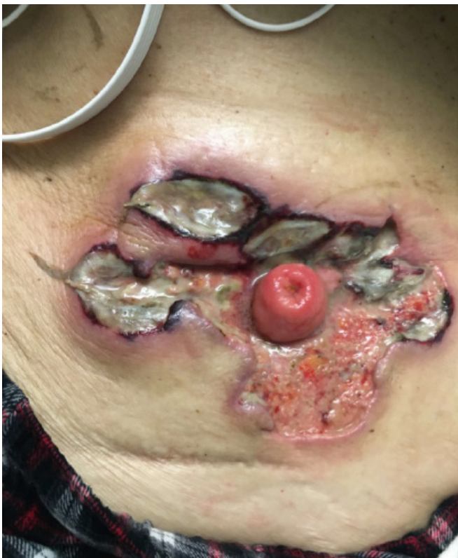
Photo taken prior to development of abdominal wall necrotizing soft tissue infection.

ation of the peristomal wound. There was diffuse abdominal wall pain, greatest intensity localized to the right-sided ulceration (Figure 1). A CT scan of the abdomen revealed an intraabdominal fluid collection. Broad-spectrum IV antibiotics were started, and the patient was transferred urgently to the operating room for excisional debridement of the abdominal wall necrotizing soft tissue infection. A computed tomography-guided abdominal drain was placed to drain the intraabdominal abscess, with 310 mL of purulent fluid aspirated. Drain output transitioned to greenish-yellow fluid consistent with succus, and an enteral fistula was diagnosed.