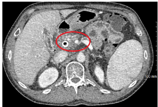
Figure 3. CT Showing Decompression of Peripancreatic Varices 3 Weeks after TIPS. Published with Permission

This procedure was complicated just over a week later by the development of sepsis secondary to an infected biloma that was successfully treated by percutaneous drainage and antibiotics. Liver function tests, particularly total and direct bilirubin, improved quickly after drainage. A follow-up CT was performed six weeks after the initial TIPS procedure and showed successful decompression of the pancreatic varices (Figure 3). He subsequently underwent successful pancreaticoduodenectomy with lateral PV resection. Final pathology revealed 1.3 cm moderately differentiated ductal carcinoma with negative margins and 24 negative lymph nodes. Surveillance duplex revealed a patent TIPS and left PV five months postop with no evidence of disease at six months postop.