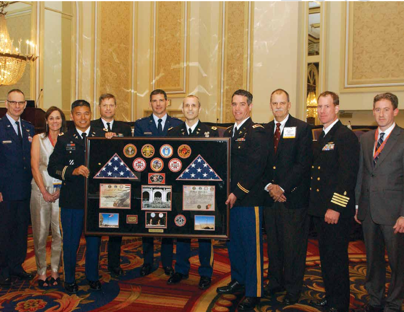
The first meeting of the reestablished Excelsior Surgical Society, Chicago, 2015