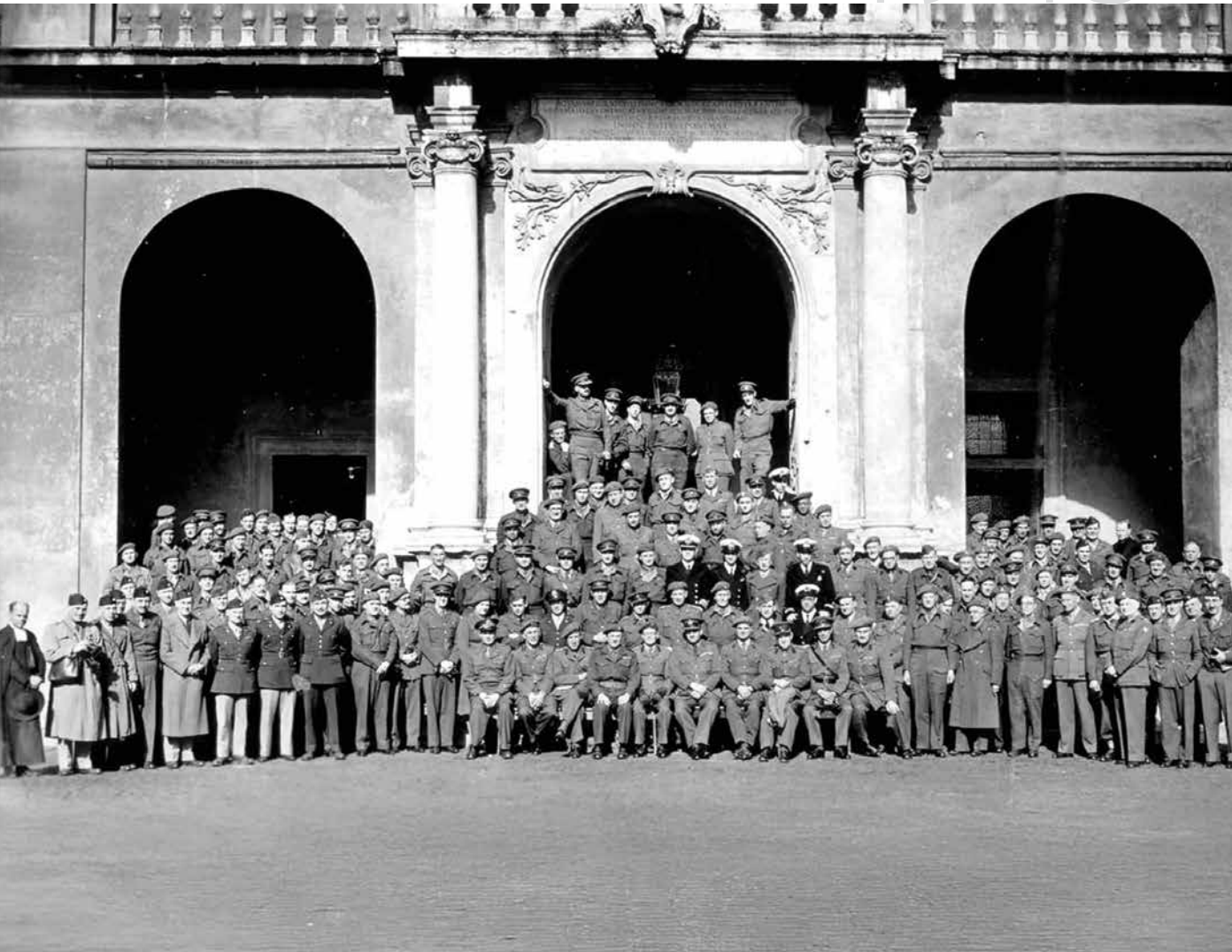
First meeting of the surgeons who would form the Excelsior Surgical Club, Rome, 1945